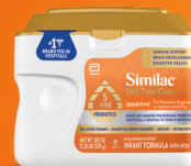
Similac® 360 Total Care® Sensitive**†‡