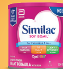
Similac® Soy Isomil®