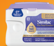
Similac Pro-Total Comfort**†‡