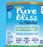
Pure Bliss® by Similac**†‡