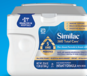
Similac® 360 Total Care**†‡